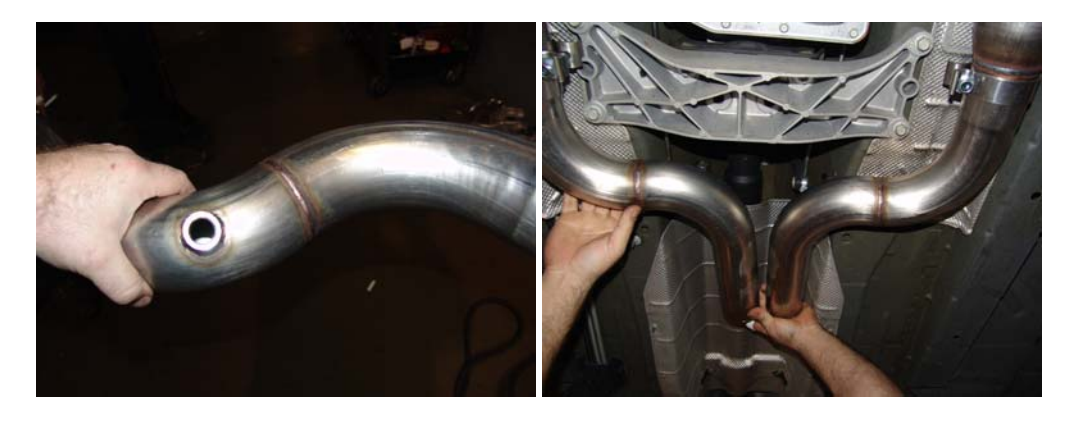
Figure 15: S pipe being installed with rear 02 sensors.