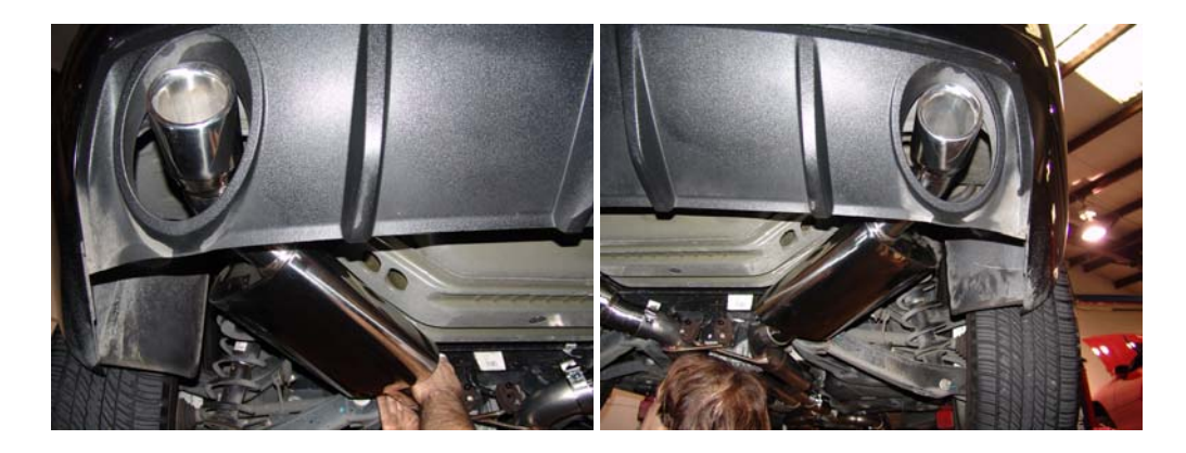
Figure 18: Install of Mufflers

Once installed, make sure all clamps are tight and wires plugged in. We suggest checking header bolts after the first heat cycle. Now you are ready for the tune and first drive!