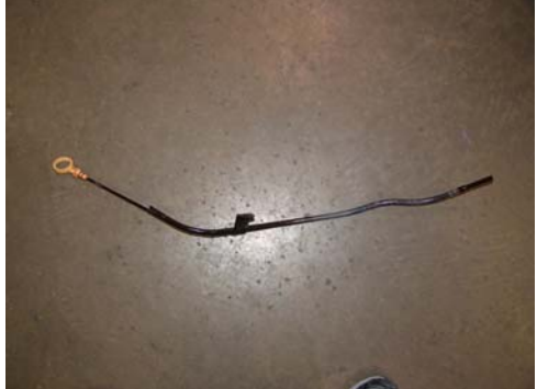
Figure 1: Removing factory dipstick

Move on to removing the spark plug wires and spark plugs from the engine. Be careful not to drop any of the spark plugs as this will damage the plug and cause a misfire condition. Also make sure to pull by the boot on the wires or they will separate. If your car has over 30,000 miles now is a good time to think about new wires. Once this is done, the next electrical part that needs to be completed is removal of the factory 02 sensors. There are 4 sensors in the stock exhaust. Unclip the sensors from their wires and make note which sensors are used in the front and which are used in the rear. You may find this easier to do after the factory H pipe has been removed.