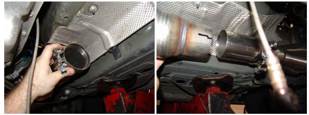
Figure 13a and 13b: 3" clamp over collector and high flow cat onto collector