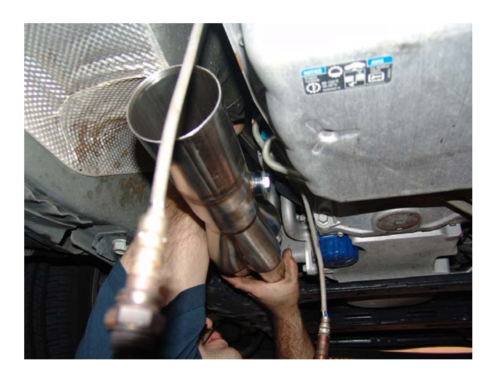
Figure 9: Install of Driver side header

Now install the header on the passenger side to start the rest of the install. The header should install from the bottom up. We also only recommend using GM header gaskets for the 2000 LS1 Camaro/Corvette as these use the same port design as the headers and have proven the best seal.