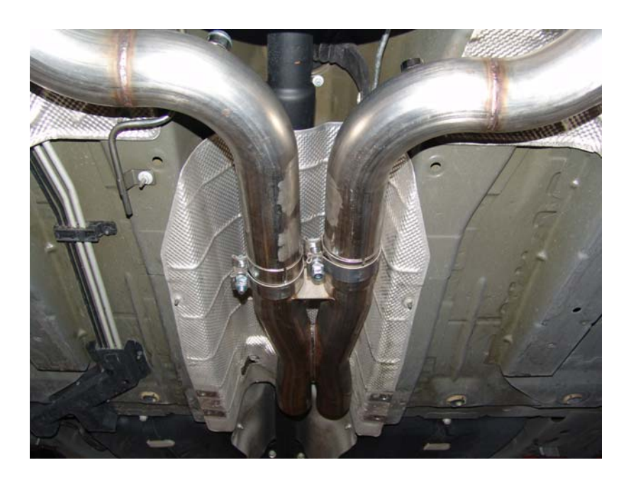
Figure 16: install of X pipe onto S pipes.