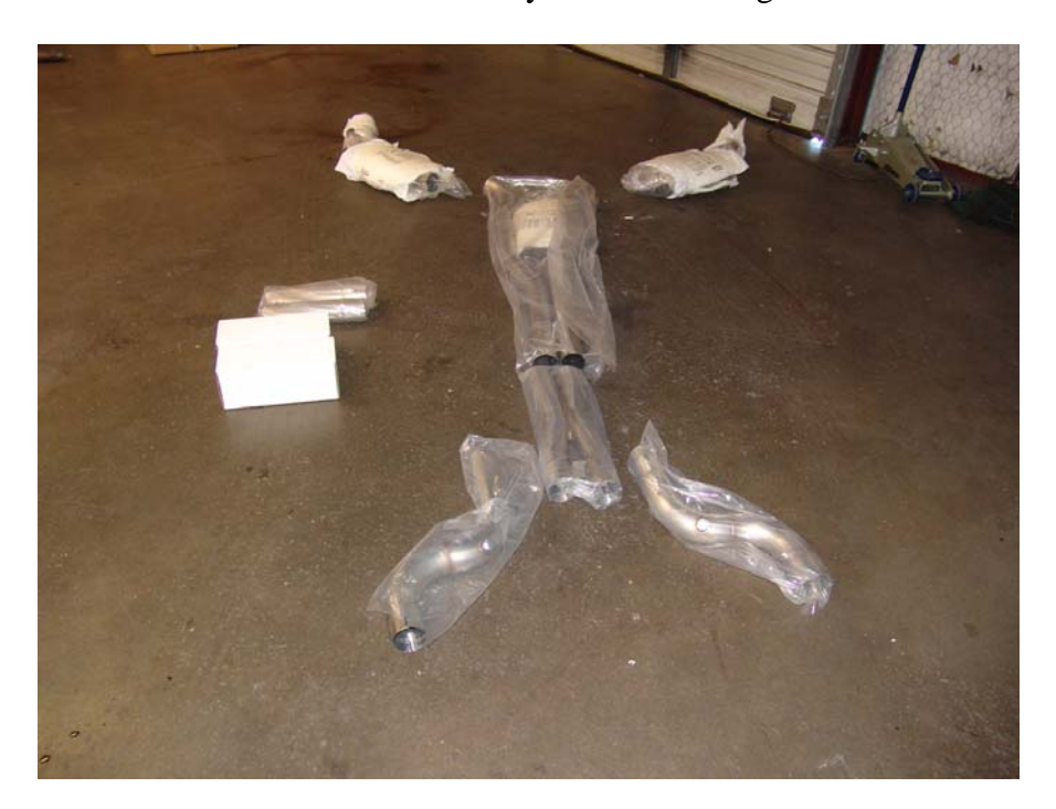
Figure 12: Rear S pipes, X pipe, mid section and optional mufflers

Now that the headers have been installed, slide one 3" clamp over each collector and install your high flow cats or your off-road pipes. Once these are on, slide over one more 3" clamp on each of these pieces. You can loosely tighten the clamps down, but do not tighten all the way until the entire system has been hung in place and adjusted. The remainder of the exhaust will look like the layout shown in figure 12.