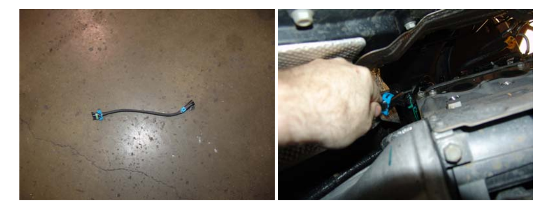
Figure 8: Front 02 sensor extension

Before install, take this time to install your front 02 sensor extensions onto the car harness where you unplugged the factory sensors. Now you can start by installing the driver side header from the bottom side of the car. The headers should slide into the engine compartment by pointing the collector towards the inside of the car and down, and rotate into place. You can 'hang' them from the head bolts until you can go back on the top side. I suggest installing only a front and rear bolt with the gasket first then only starting the rest of the bolts before installing the rest of the system. Once the headers are there you can install the sensors and plug into the extensions.