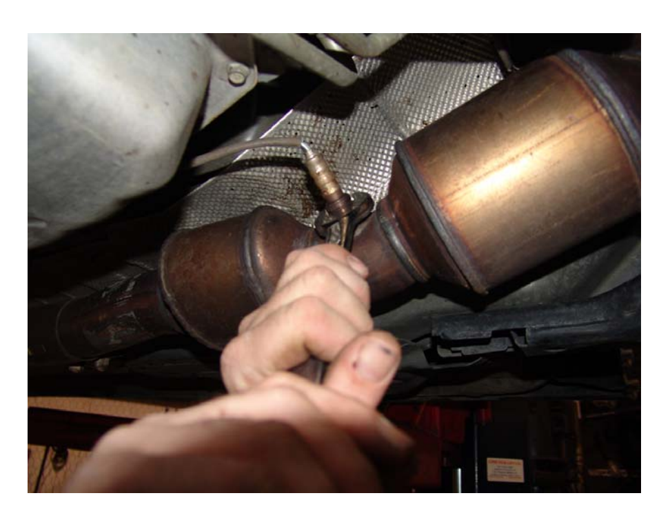
Figure 4 : Removing rear 02 sensor.