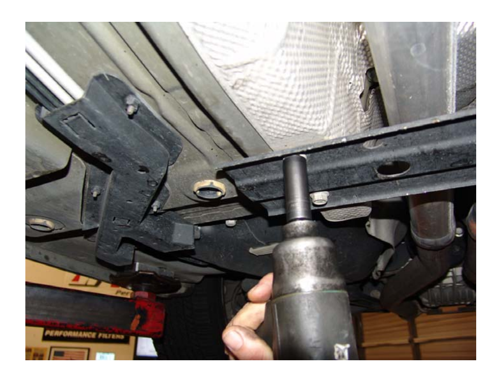
Figure 2: Center tunnel brace removal.

Now move to the front of the car and un-bolt the clamps at the cats at the front of the car and remove the mufflers from the hangers and the mid pipe hangers under the diff. You may need to have a friend help you as the mid-section and mufflers is welded together and removes as one piece. This is heavy so have help.