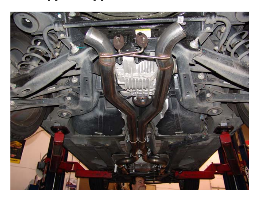
Figure 17: Rear mid section installed into rear hangers.

Once you have the entire mid section installed and loosely tightened into place it is now time for a decision. If you have the LG high flow 3" mufflers then you can simply slide over your next pair of 3" clamps, install the mufflers, align and tighten all of your clamps working you way rear to front. If you want to re-use your stock mufflers you need to measure and cut the factory mufflers from your stock system and use the supplied adapters to install. If you have an aftermarket system that is 2.5" then use the adapters, and install just like you did on your stock system. Align your mufflers first and work your way forward on tightening the clamps.