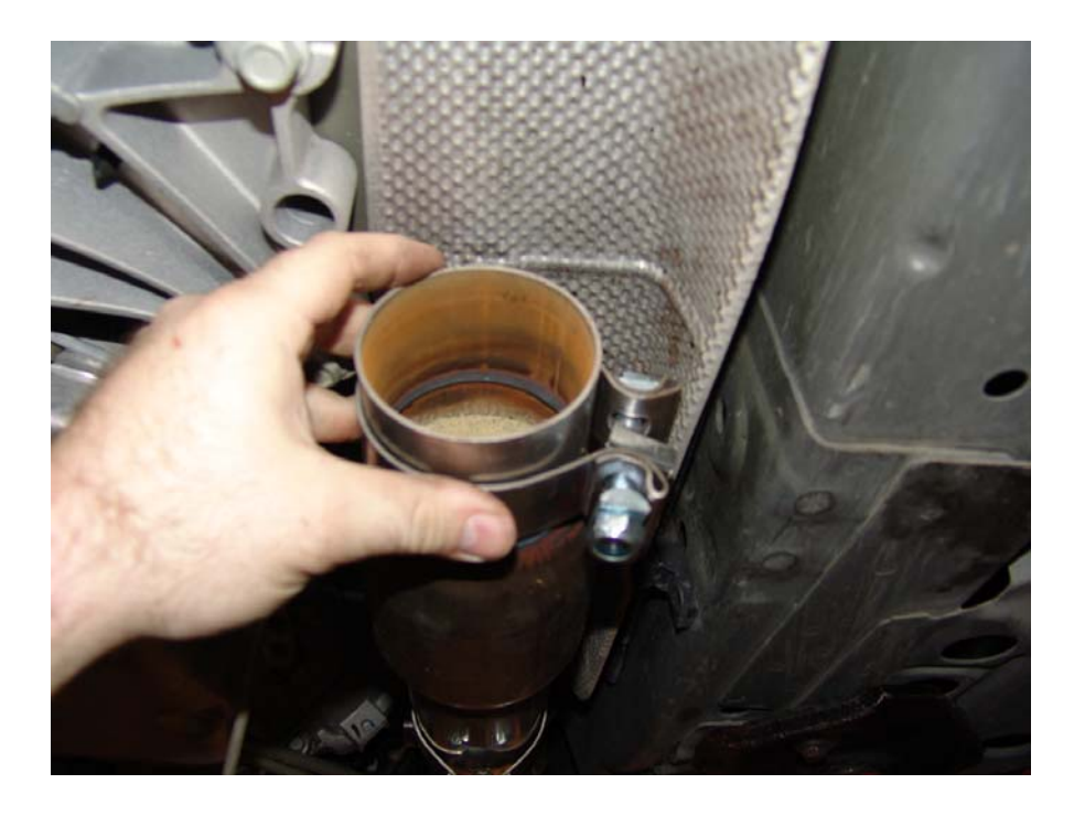
Figure 14: High flow cat installed with 3" clamp