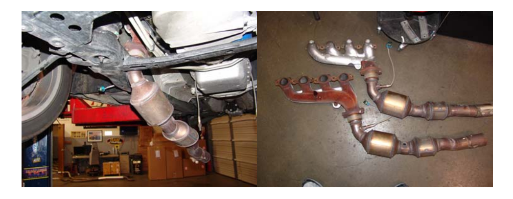
Figure 7: Removing manifolds and cats.