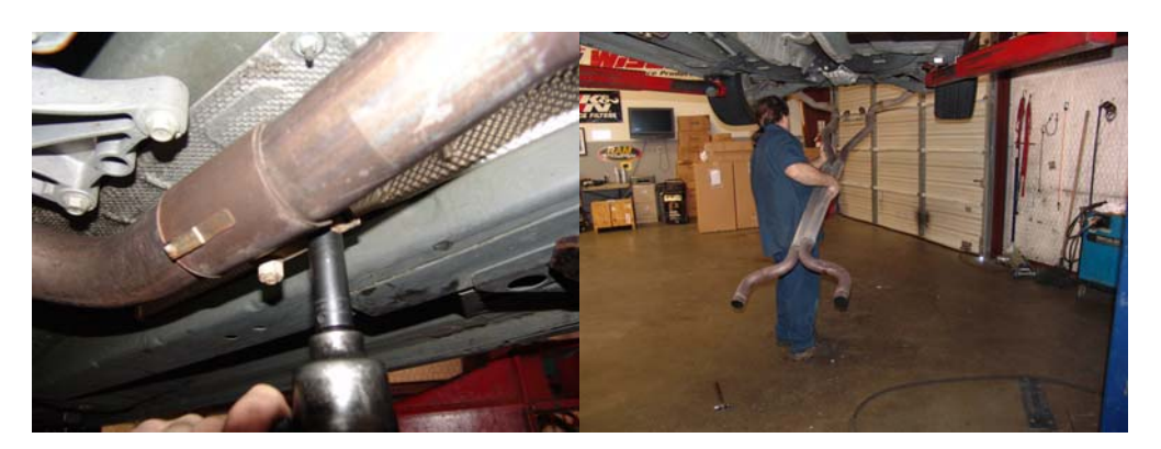
Figure 3a, 3b: Removal of stock mid section and mufflers

Now move to the front of the car and un-bolt the clamps at the cats at the front of the car and remove the mufflers from the hangers and the mid pipe hangers under the diff. You may need to have a friend help you as the mid-section and mufflers is welded together and removes as one piece. This is heavy so have help.