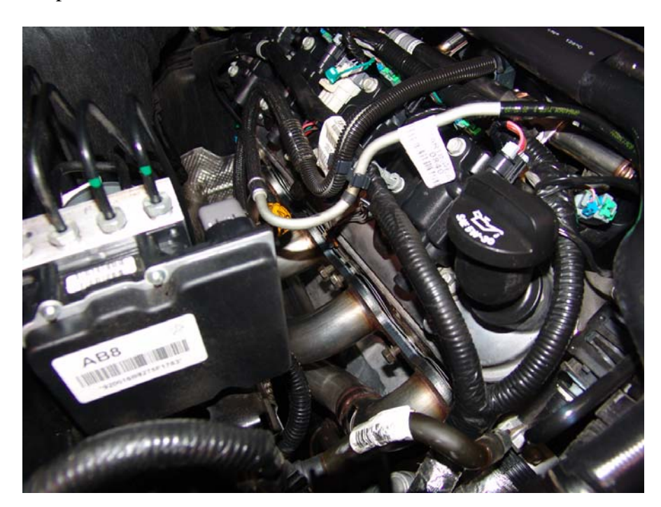
Figure 10: Passenger side header installed loosely with gasket

Now install the header on the passenger side to start the rest of the install. The header should install from the bottom up. We also only recommend using GM header gaskets for the 2000 LS1 Camaro/Corvette as these use the same port design as the headers and have proven the best seal.